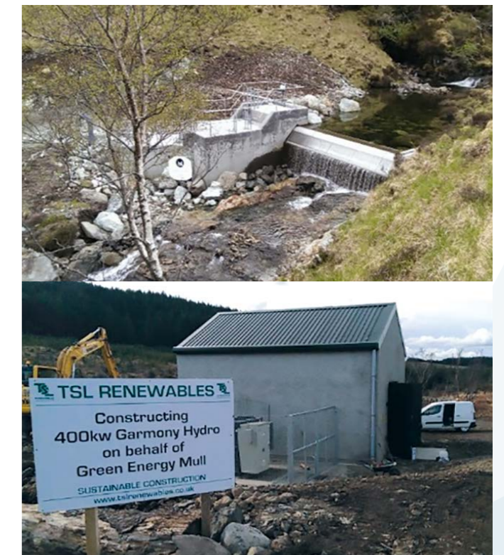
Figure 2: Garmony Hydro Scheme (MICT, 2019)

Members of the community energy group were not fixed on any particular renewable technology. In the end, a run-of-the-river hydro facility was chosen for several reasons (Figure 2).