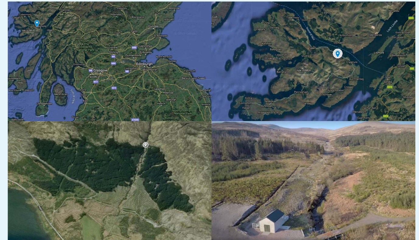
Figure 1: GEM project location

GEM generates its revenue from exporting electricity generated by the hydro to the grid and from subsidies such as the Feed in Tariff (FiT). Any surplus revenue is gifted to the Waterfall Fund (see Section 4.5.3), a charity specifically set up for the project to distribute the funds to worthy causes around the local islands.